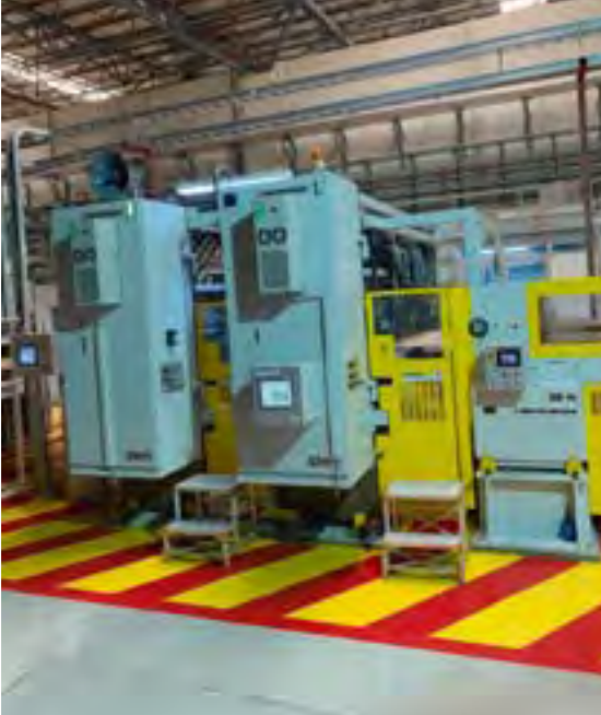
The first MHI 67H-V outside of Japan

MarquipWardUnited double backer with Simon S-Press loading system, Mitsubishi 67H-V slitter scorer (which is the first of its type to ever be