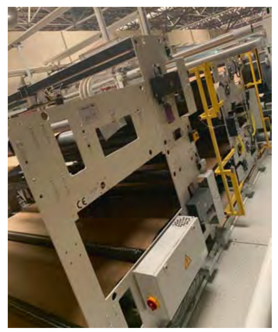
The new corrugator is equipped with E+L Corraligner

installed outside of Japan) and the MarquipWardUnited Fusion cut-off knife and stacker. The line is equipped with EFI Escada's Syncro process