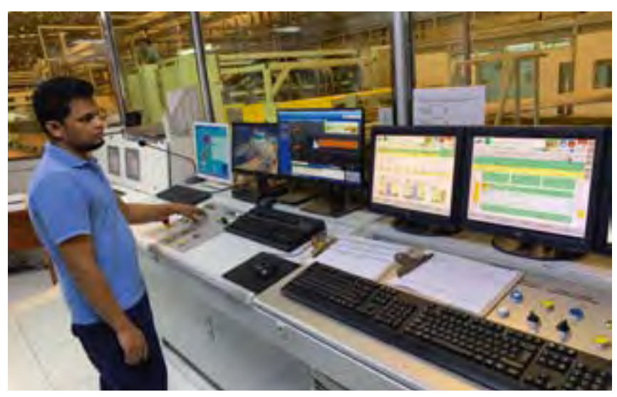
The control room on the new corrugator

control, Escada Process control and an E+L Trim Master and bridge control units. Steam is produced by a Baviera system and starch is mixed in an SRP Europe starch kitchen. The new line has a capacity of 160 million sqm of board per year.